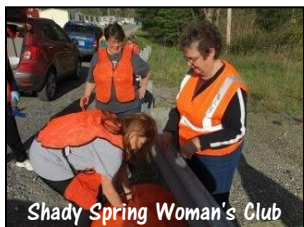
Shady Spring Woman's Club