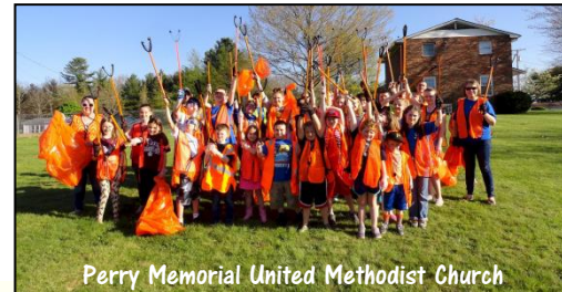
Perry Memorial United Methodist Church