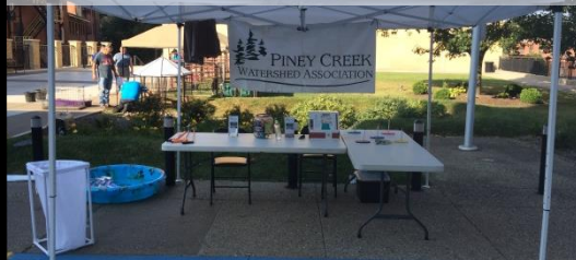
The association booth at Beckley Kid's Fair

The association supported numerous community events this Summer and we plan to continue our outreach this Fall. This Summer we supported the Friends of Coal Auto Fair, Taste of Beckley, and the Beckley Kids Classic. Each event was unique and helped us meet new people and understand the issues in the community that affect our watershed.