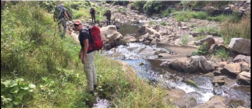
Members of Trout Unlimited carry trout in backpacks to stock in Cranberry Creek.

The association supported numerous community events this Summer and we plan to continue our outreach this Fall. This Summer we supported the Friends of Coal Auto Fair, Taste of Beckley, and the Beckley Kids Classic. Each event was unique and helped us meet new people and understand the issues in the community that affect our watershed.